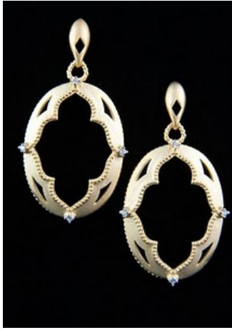
The Wave hoop earrings (my pick for value - a lot of wear for the money)